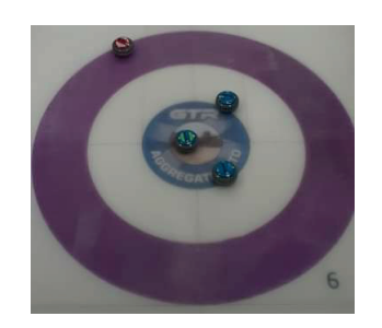
BLUE SCORES 3